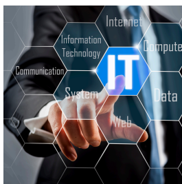
IT & ITES